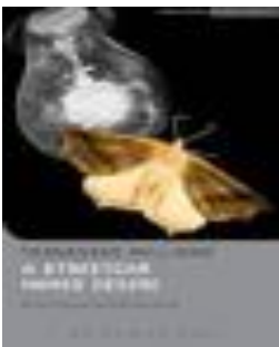
A Streetcar Named Desire , by Tennessee Williams