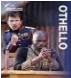
Othello , by William Shakespeare

(If you are in receipt of Free School Meals, or are struggling financially please do get in touch. We may be able to help you.)